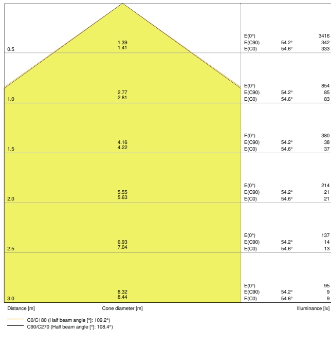
LDC typ cone