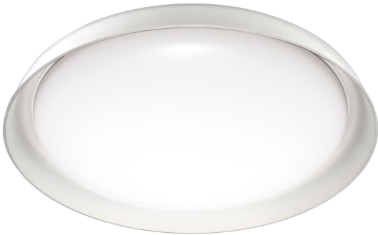
Plate | Decorative ceiling luminaires with WiFi technology