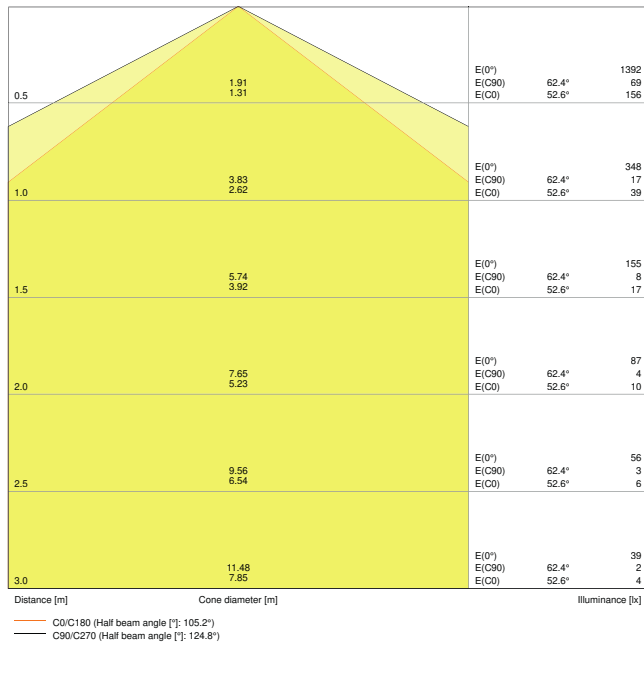
LDC typ cone