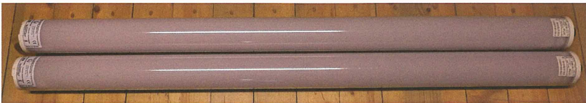
Picture 1. Luminary enclosure type Secure LED 26W 3800LM