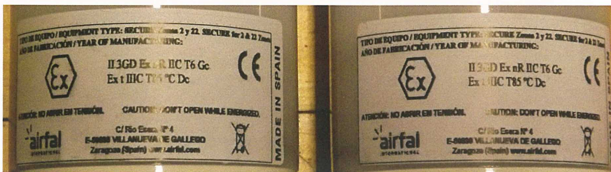
Picture 3. Determination of the type of construction of tested luminaries