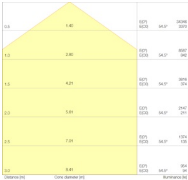
LDC typ cone