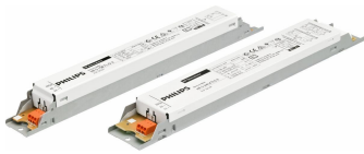
HF-S 118, 136 & 158 TL-D II, HF-S 3/414, 3/424 TL5 II