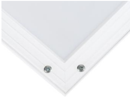
Abb. 1: Up and Down Panel Ansicht der Ecke