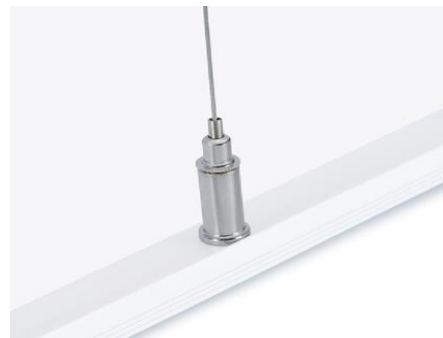
Abb. 2: Up and Down Panel Abhängung